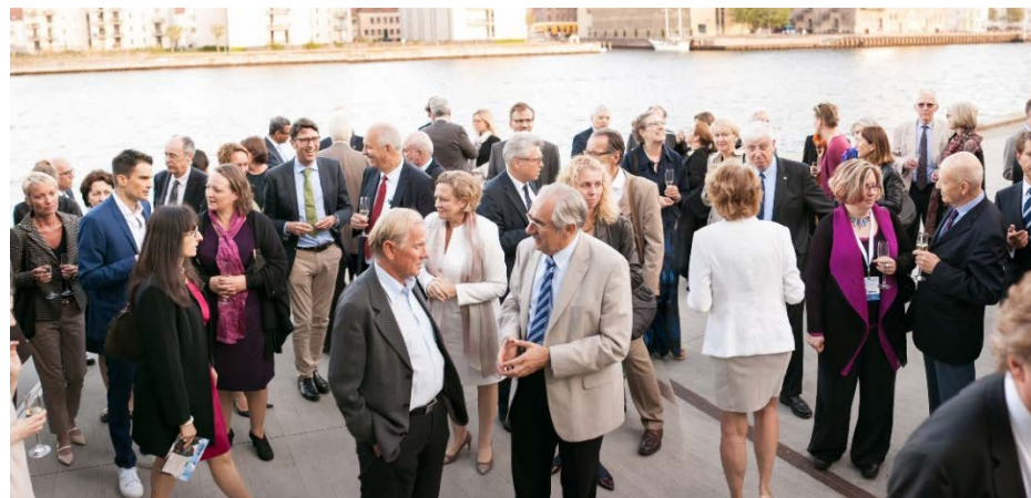
A happy crowd chatting and enjoying the evening