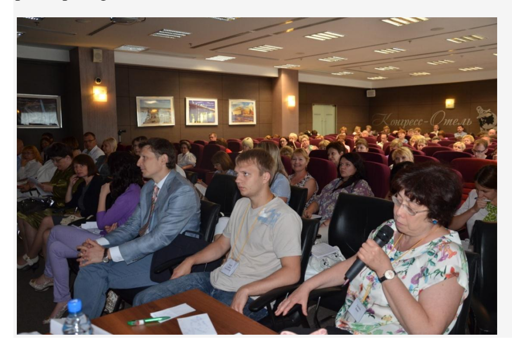
Participants and local translator.

The Teaching Course brought together leading neurologists of Germany, Russia, Greece, Czech Republic, Italy and Austria. More than 300 physicians were registered! - and that's just only part of our participants, because we did not perform registration during the scientific sessions (despite the fact that we were expecting only 150 members, but in Siberia scientific events of such a high level are rare, and the opportunity to participate in the international conferences for physicians is very limited, so the Siberian doctors were very interested in participating in the RTC of the EFNS).