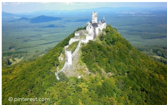
The Bezděz Castle

The dominant feature of the region is one of the most important early gothic castles in Bohemia - Bezděz . This royal castle was built on a hilltop (638 m a.s.l.) between 1260-1279 by a Czech king Přemysl Otakar II. The king Václav II. with his mother Kunhuta were held here as prisoners. During the 30years war (1618-1648) the castle was burned down by Swedish soldiers. Later it has been turned into a Benedictine monastery. After the Benedictines have left around the year 1785, the castle became deserted. It became a romantic ruin, which is described in many works by the most important Czech romantic poet - Karel Hynek Mácha.