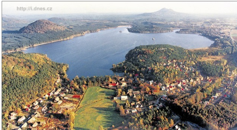
The Mácha's Lake