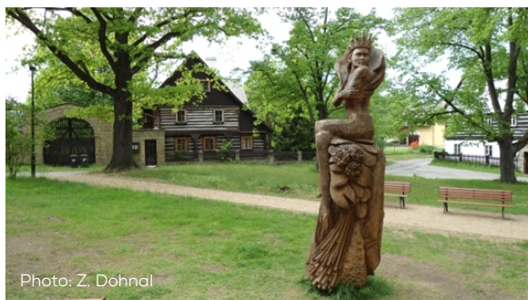
Staré Splavy - Queen of the Lake

The dominant feature of the region is one of the most important early gothic castles in Bohemia - Bezděz . This royal castle was built on a hilltop (638 m a.s.l.) between 1260-1279 by a Czech king Přemysl Otakar II. The king Václav II. with his mother Kunhuta were held here as prisoners. During the 30years war (1618-1648) the castle was burned down by Swedish soldiers. Later it has been turned into a Benedictine monastery. After the Benedictines have left around the year 1785, the castle became deserted. It became a romantic ruin, which is described in many works by the most important Czech romantic poet - Karel Hynek Mácha.