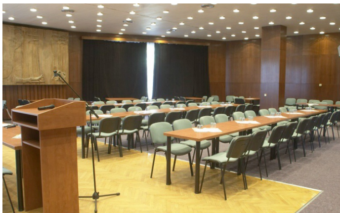
The hotel's congress hall

All other meals and beverages during your stay go on your own expenses and you will be charged by the staff of the hotel.