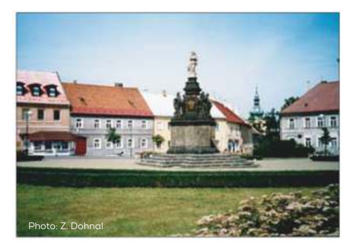
The Doksy square with the Marian sculpture

The town of Stare Splavy, situated on the northern shore of the lake, became part of Doksy in 1850 and has ever since contribute to the development of tourism in the region.