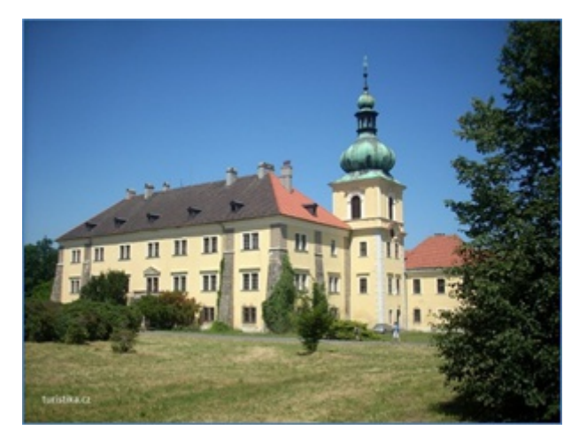
The Doksy Castle

The town of Stare Splavy, situated on the northern shore of the lake, became part of Doksy in 1850 and has ever since contribute to the development of tourism in the region.