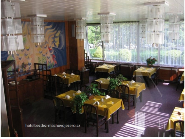
Dinning hall in the hotel